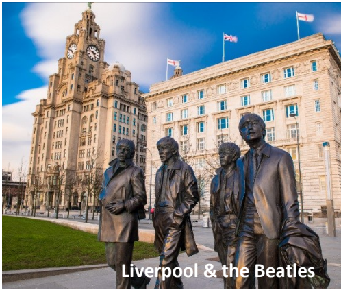
Liverpool & the Beatles